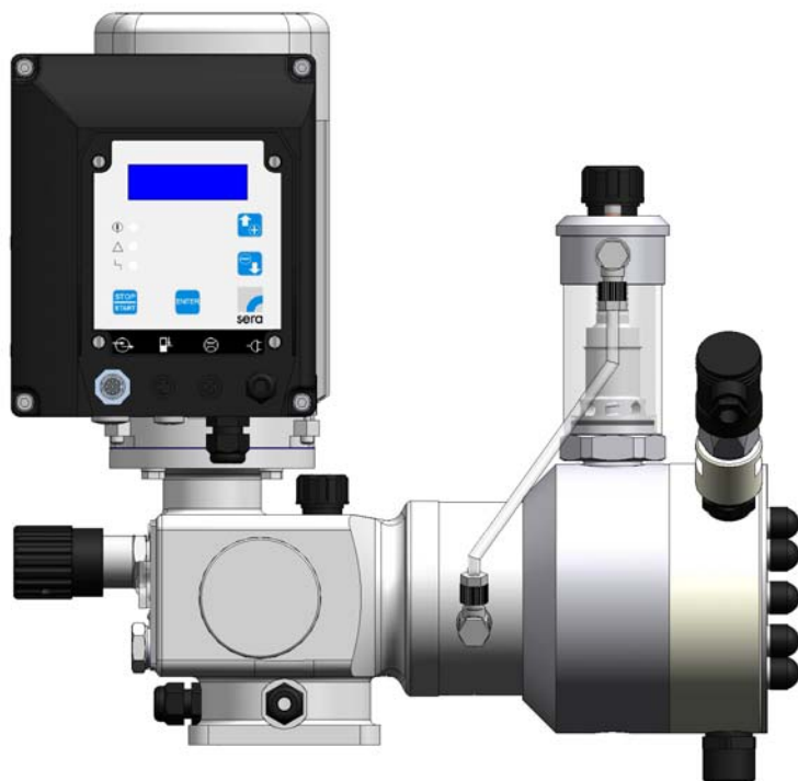
Controllable piston diaphragm pump type C 409.2